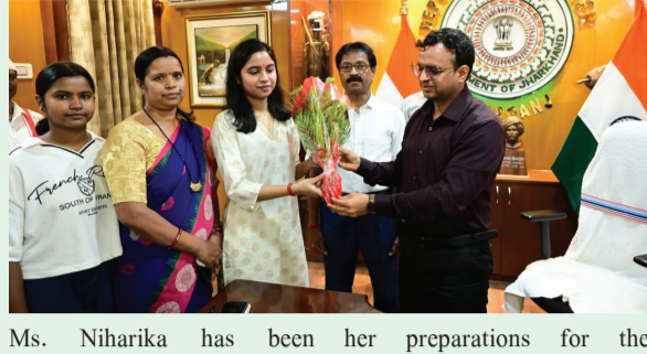
Deputy Commissioner Honors Her with a Bouquet and a Shawl