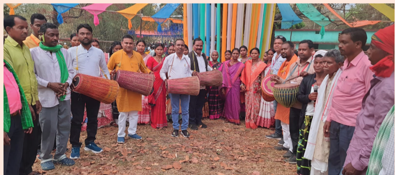
Tribal women performing cultural dance and songs